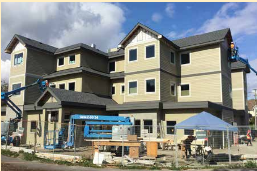
Exterior, September 18