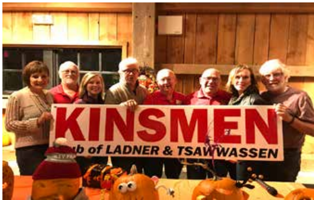
DELTA, BC (October 14, 2017) During local Kinsmen's Crab and Corn fundraiser, a $1000 donation to Reach comprised of concession funds raised raised at Ladner Street Festival was announced! Proceeds from the Crab & Corn evening will also benefit local charities.