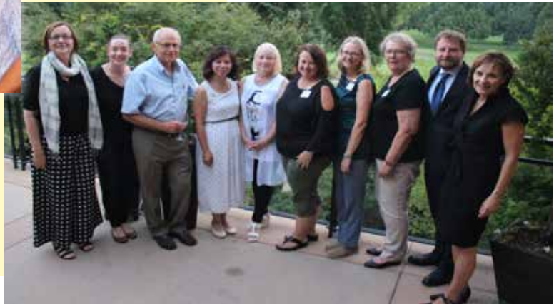
Reach Society Board 2017/2018