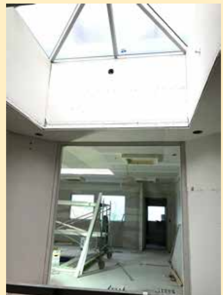
Atrium over main stairwell