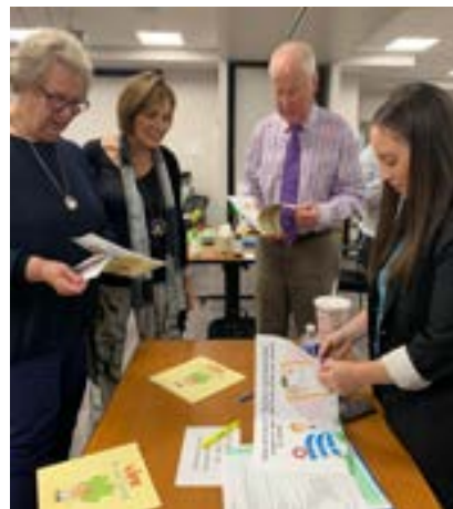
REACH AGM 2022

Stay tuned for registration details via member email and REACH website.