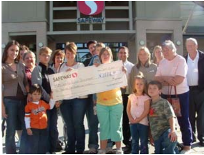
Tsawwassen Safeway's We Care Campaign raises $10,116.64 for DACD!!