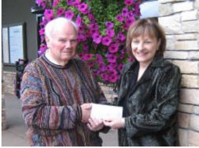
The TOOBS presented a cheque for $1,500 for our Gift of Speech campaign!